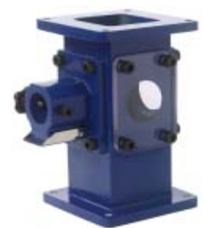
Neckpiece for 4 pcs CF 380 or CF-500