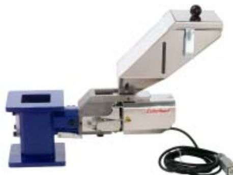
The hoppers are easily mounted and changed