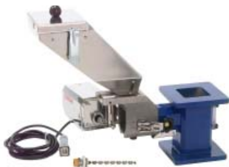
Easy to open when cleaning or changing dosing screw