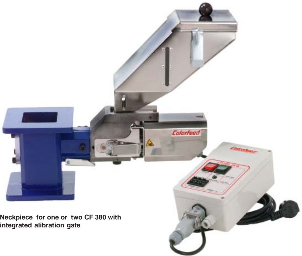
Neckpiece for one or two CF 380 with integrated alibration gate