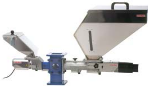
Neckpiece for 4 pcs CF 380 or CF-500