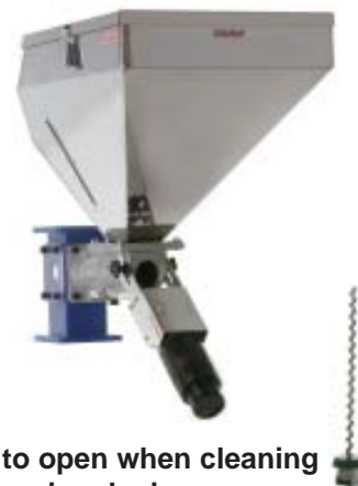
Easy to open when cleaning or changing dosing screw